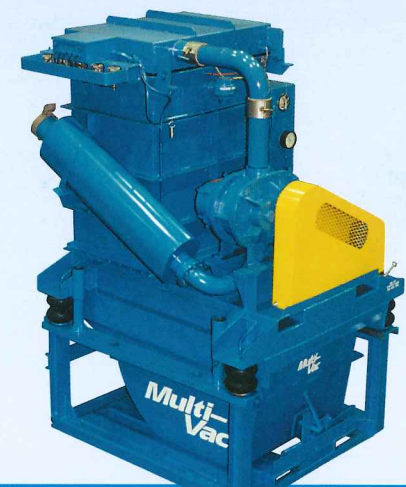
Conversion Units and Upgrades Page 10