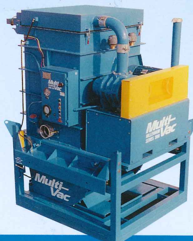
Millennium Series Page 7