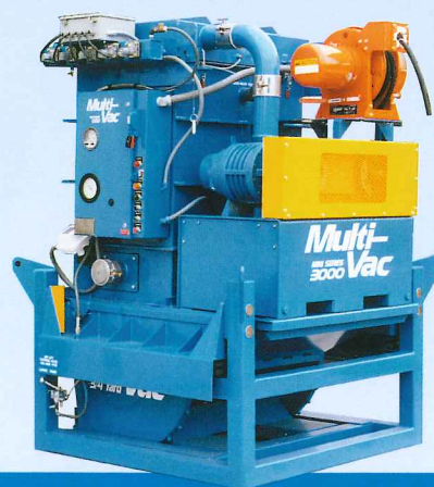
Mini Series Page 6