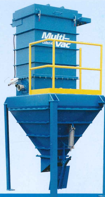
Stationary Systems Page 8