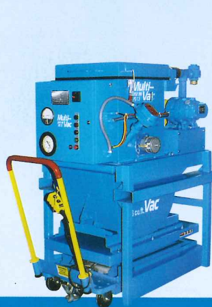
Super Mini Series Page 5