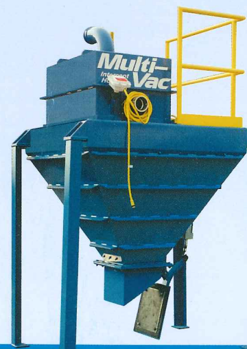
Intercept Hoppers Page 8