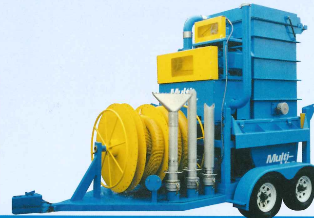
Trailer Units Page 9